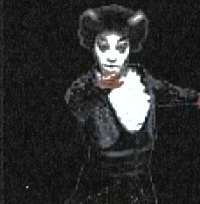
QUAXO OR MR. MISTOFFELEES

the mystery cat. A scruffy ginger cat, with crumpled whiskers and dusty fur. He is a wicked criminal who always gets away with it because he is never caught at the scene of the crime.