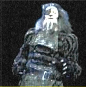
GROWLTIGER & GRIDDLEBONE

Naughty, cockney twins, always up to mischief and all sorts of tricks. They look so alike their family never knows who to blame.