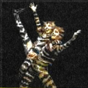
MUNGOJERRIE & RUMPLETEAZER

A very large black cat with white feet who like nothing more than to eat and be seen in all the best places.